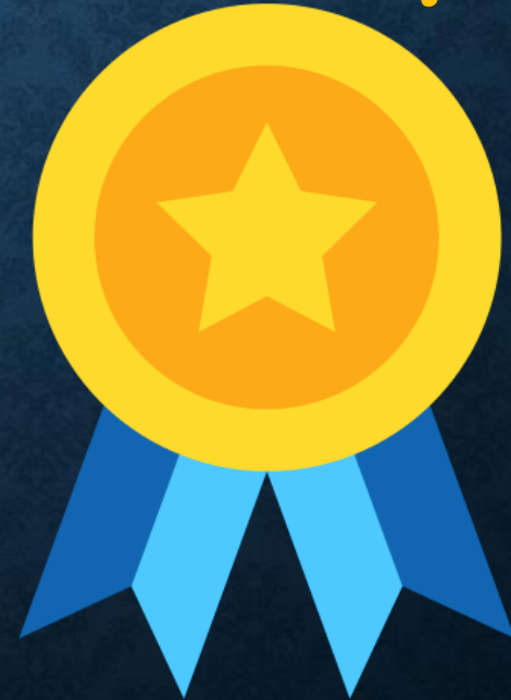
NISHEE SINGH (CLASS X-E)